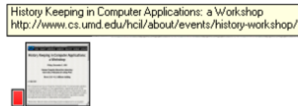
Figure 3 – Full-sized thumbnail and tool tip

Additional detail is provided as a tool tip. As a person moves over a particular item in the list, we immediately display the page's full title, URL, and full-sized view of the thumbnail (see Figure 3).