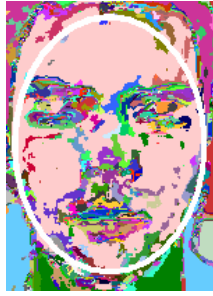
Fig. 3. Ratio of approximating ellipse and real fragment.

other hand pick out permissible objects. To do this it's enough to estimate accuracy of the constructed approximation.