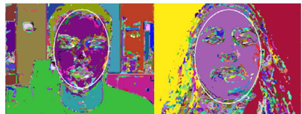
Fig. 2. Ellipse approximations of face-like fragments.

It's easy to see that the algorithm finds an approximating ellipse for any fragment. At the same time, the accuracy of approximation essentially depends on the shape of the fragment: the closer fragment to ellipse the better approximation is. These properties of the algorithm relies, on the one hand, regulated degree of feasibility of hypothesis that the face has an elliptic shape and on the