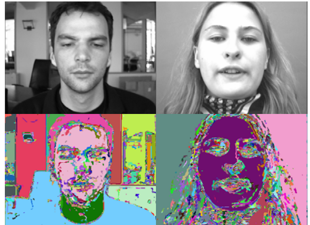
Fig 5. Example of fragmentation algorithm working

As a result of the algorithm matrix U which contains all image fragments will be constructed.